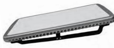
Non-Adjustable OneWeb Mobility Mount w/Panel