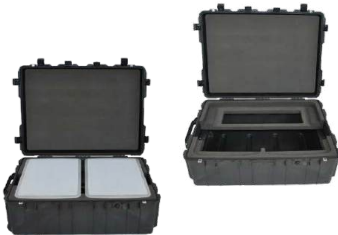
OneWeb Transportable Case for HL-1120 ESA (OW-1120-TC)