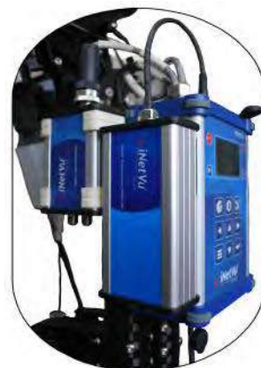
Typical Instal on Manpacks