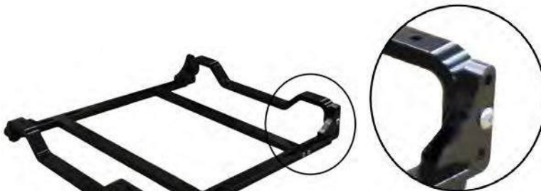
Adjustable OneWeb Mobility Mount Pre-Assembled (OW-1100-ADJ)