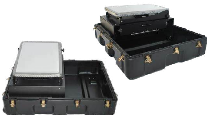
OneWeb Transportable Pop-Up Case for HL-1100 ESA (OW-1100-TC-POPUP-ADJ)