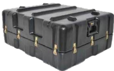
OneWeb Pop-Up Transportable Case for HL-1120 ESA (OW-1120-TC-POPUP-ADJ)

The iNetVu® OneWeb Transportable Pop-Up Case is designed to accommodate the dual-panel HL1120 ESA. It allows the user to fully operate the HL1120 ESA antenna directly from its transportable case. The HL1120 ESA panel tilt angle is adjustable, and the case design provides space for a modem, power supply, cables, and an additional storage area for any extra peripherals.