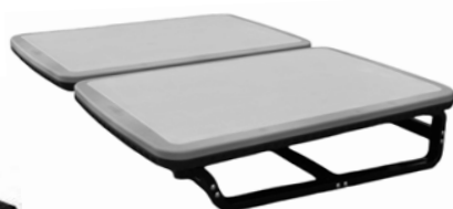
Non-Adjustable OneWeb Mobility Mount w/Panel