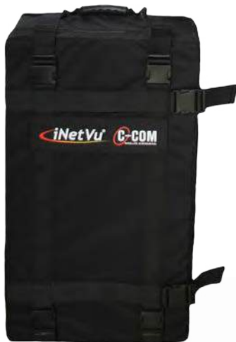
Soft Case Solution (Front View)

The iNetVu® MP-61-MOT is a fully motorized, auto-acquire, 60 cm carbon fiber Manpack antenna. This robust and lightweight system will point to any programmed satellite with just the push of a button on the NEW iNetVu® 8050 Controller. The 8050 Controller supports DVB-S2X and is fully compatible with a list of open AMIP supported modems. C-COM's highly portable, multi-segment Manpack can be hand-carried by one person and assembled in less than 10 minutes with no tools required.