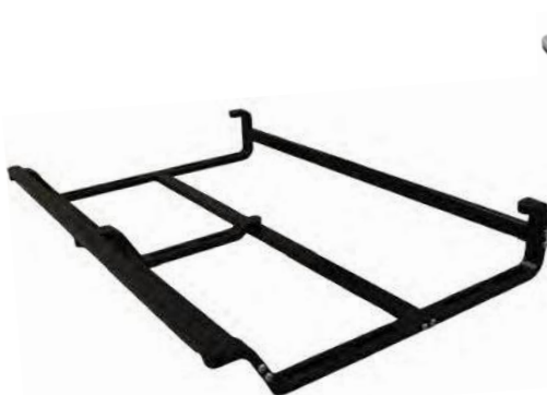
Non-Adjustable OneWeb Mobility Mount Pre-Assembled (OW-1120-NON-ADJ)