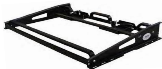
Adjustable Low-Profile OneWeb Mobility Mount Pre-Assembled (OW-1120-ADJ)