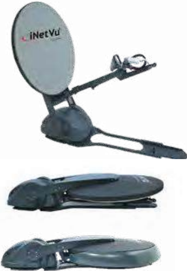
982 Stowed (with pod option)

The iNetVu® 982 Drive-Away Antenna is a 98 cm Ku-band auto-acquire satellite antenna system which can be mounted on the roof of a vehicle for Broadband Internet Access over any configured satellite. The system works seamlessly with the iNetVu® 7715 Controller providing fast satellite acquisition within minutes, anytime anywhere.