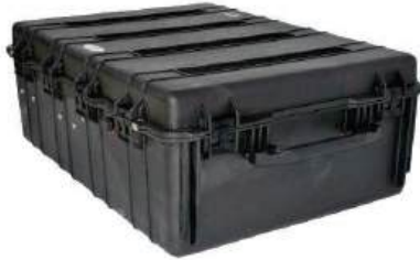
OneWeb Transportable Case for HL-1120 ESA (OW-1120-TC)

The iNetVu® OneWeb Transportable Case is designed to accommodate the dual-panel HL1120 ESA. This case allows the user to safely store and transport the HL1120 ESA antenna along with modem and cables.