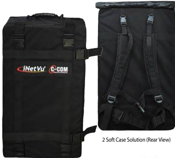
2 Soft Case Solution (Rear View)

The iNetVu® MP-130-MOT is a fully motorized, auto-acquire, 130 cm carbon fiber Manpack antenna. This robust and lightweight system will point to any programmed satellite with just the push of a button on the NEW iNetVu® 8050 Controller. The 8050 Controller supports DVB-S2X and is fully compatible with a list of open AMIP supported modems. C-COM's highly portable, multi-segment Manpack can be hand-carried and assembled in less than 10 minutes with no tools required.