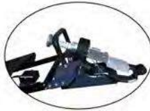
2 Port CP feed