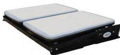
Adjustable Low-Profile OneWeb Mobility Mount w/Panel (Shown at 3 deg)