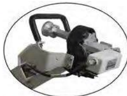
2 Port CP feed option