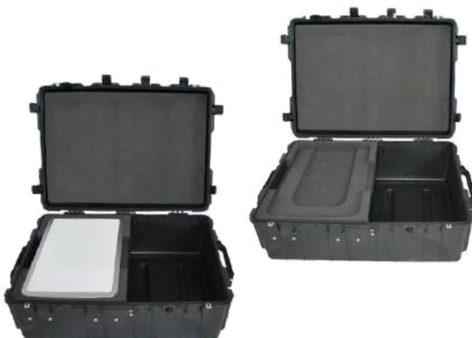
OneWeb Transportable Case for HL-1100 ESA (OW-1100-TC)