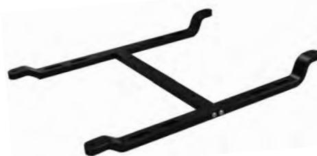
Non Adjustable OneWeb Mobility Mount Pre-Assembled (OW-1100-NON-ADJ)

* The shipping weights/dims can vary for particular shipments depending on actual system configuration, quantity, packaging materials and special requirements