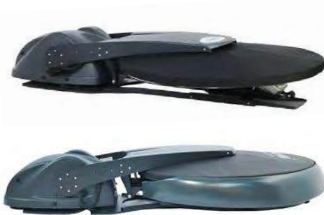
Ka-98G Stowed (with pod option)

Avanti Approved & Thor7 Type Approved; Field Upgradeable to Ku-band