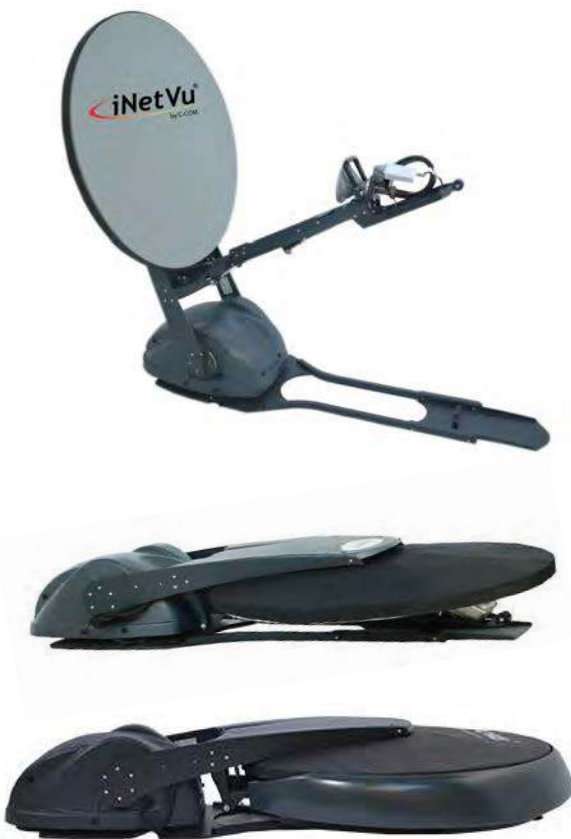
980+ Stowed (with pod option)

The iNetVu® 980+ Drive-Away Antenna is a 98 cm Ku-band auto-acquire satellite antenna system which can be mounted on the roof of a vehicle for Broadband Internet Access over any configured satellite. The system works seamlessly with the iNetVu® 7024C Controller providing fast satellite acquisition within minutes, anytime anywhere.