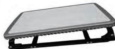
Adjustable OneWeb Mobility Mount w/Panel (Shown at 3 deg)