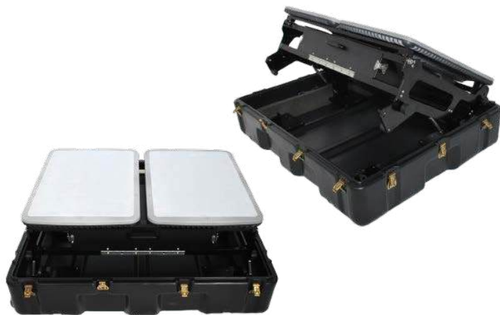
OneWeb Pop-Up Transportable Case for HL-1120 ESA (OW-1120-TC-POPUP ADJ)