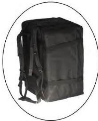
Soft Case Solution (Raer View)