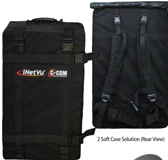
2 Soft Case Solution (Rear View)

The iNetVu® MP-130-MOT is a fully motorized, auto-acquire, 130 cm carbon fiber Manpack antenna. This robust and lightweight system will point to any programmed satellite with just the push of a button on the NEW iNetVu® 8050 Controller. The 8050 Controller supports DVB-S2X and is fully compatible with a list of open AMIP supported modems. C-COM's highly portable, multi-segment Manpack can be hand-carried and assembled in less than 10 minutes with no tools required.